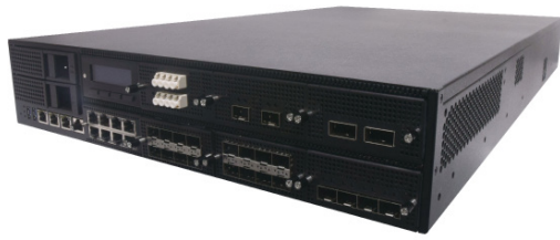
Images are for reference only. See ordering information for SKU details.

2U 19" Rackmount Network Appliance Built With 3rd Gen Intel® Xeon® Scalable Processor (Codenamed Ice Lake SP)