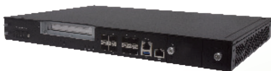
Images are for reference only. See ordering information for SKU details.

Short Depth Chassis Edge Computing Appliance with Intel Xeon® D-2100 Multi-core Processor (Codenamed Skylake-DE)