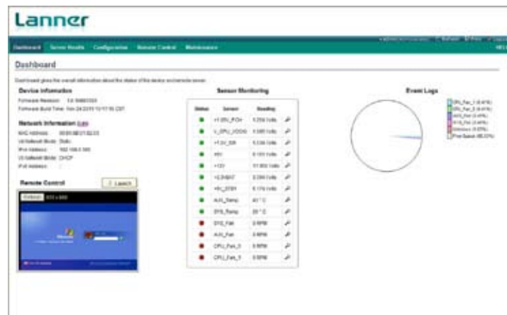
Figure: Dashboard screenshot